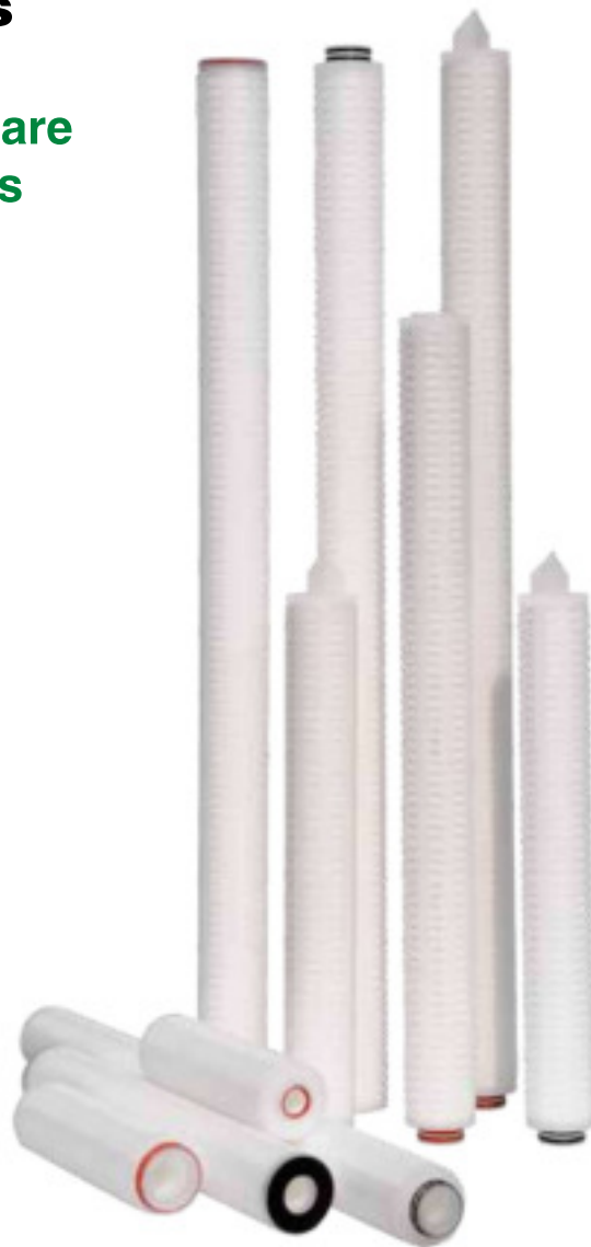
Pleated Polypropylene Cartridges