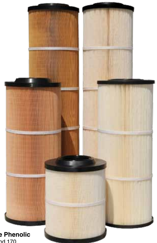
Cellulose Phenolic 90 and 170