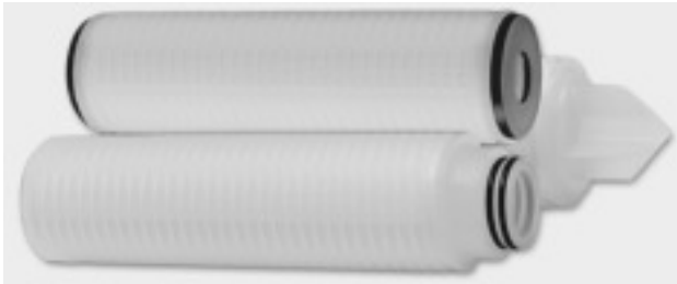
figure 1: XPleat PES filters