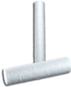
Figure 1: Hytrex RX Depth Cartridge Filters