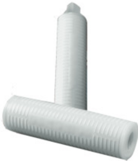
Figure 1: Flotrex AP Filters