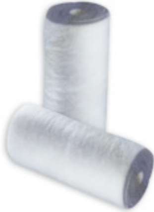
figure 1: Aquatrex filters