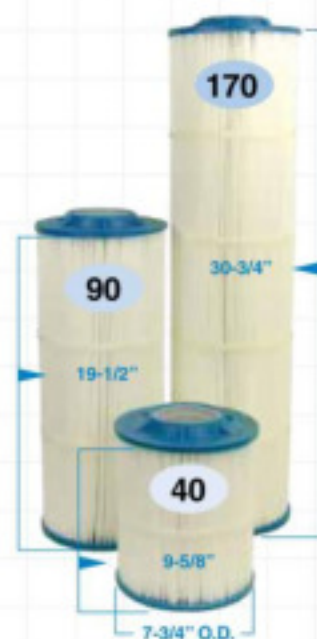
Premium Hurricane® Polyester Cartridges