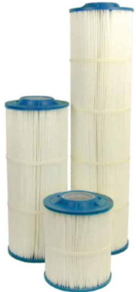
Premium Hurricane® Polyester Cartridges