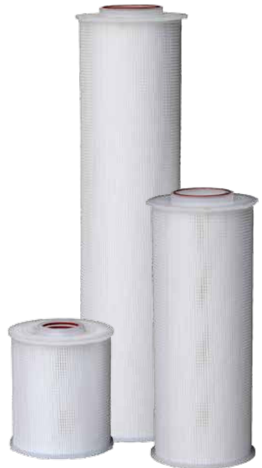
Premium Hurricane® All-Poly Cartridges